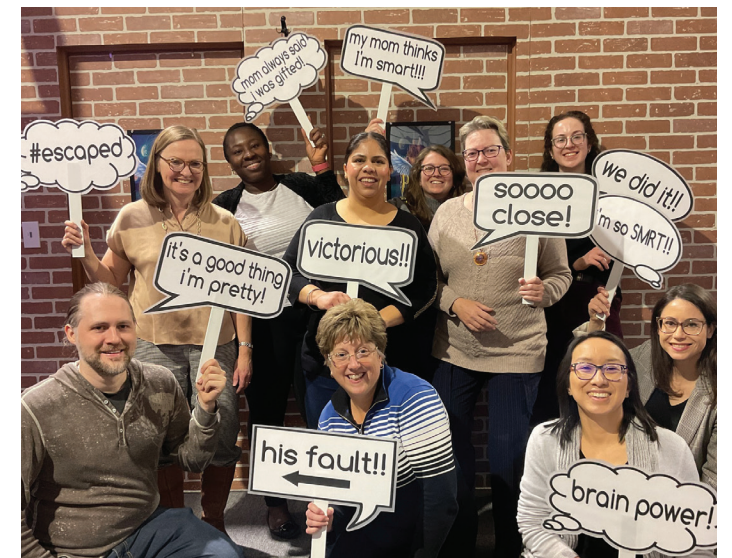
Our team works in locations across Canada; we enjoy getting together for team building activities.