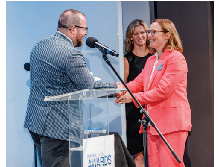
I was delighted to accept a Water Canada award on behalf of the CWN team.