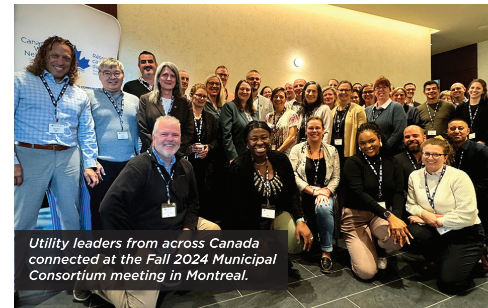
Utility leaders from across Canada connected at the Fall 2024 Municipal Consortium meeting in Montreal.

Convening a nationwide peer network of water utility leaders