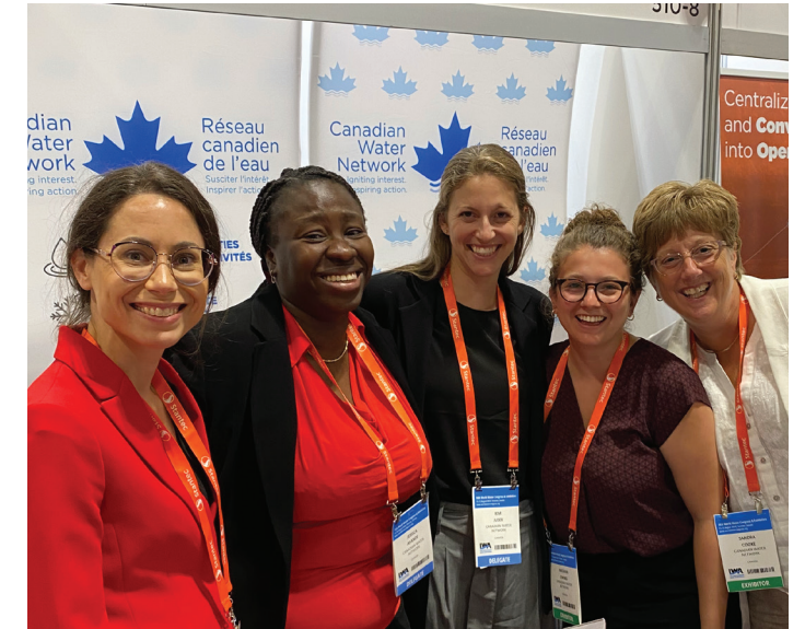
Go team! Staff regroup after a busy day at IWA's World Water Congress.